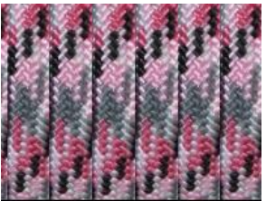
Sneaky Pink Camo